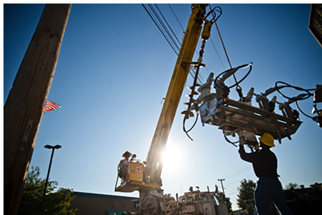
Installation of an IntelliRupter Fault Interrupter.

EPB's planning strategy for this deployment involved evaluating the number of customers per segment, load per segment, and the amount of overhead-line exposure per segment. That process resulted in